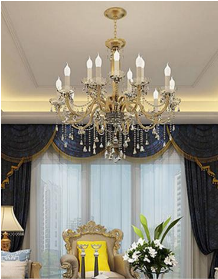
Living room chandelier