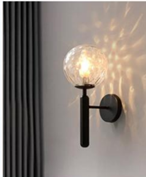
Aisle wall light