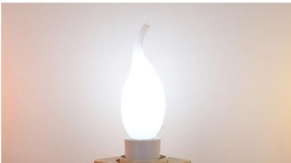
Cold white light