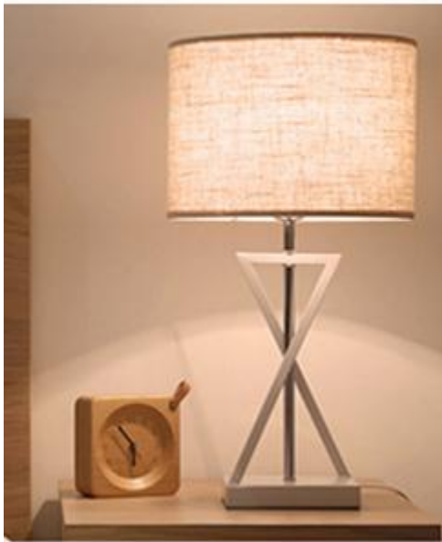
Bedside table lamp